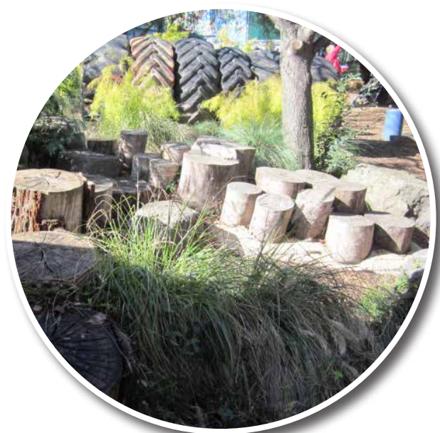
NATURE PLAY NODES PRECEDENTS